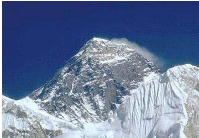
29,035 foot Mount Everest

James Whittaker of Redmond, Washington, became the first American to top the peak, reaching Everest's summit with his Sherpa climbing partner Nawang Gombu. In 1975, Japanese mountaineer Junko Tabei became the first woman to conquer the mountain. Three years later, Reinhold Messner of Italy and Peter Habeler of Austria achieved what had been previously thought impossible: climbing to the Everest summit