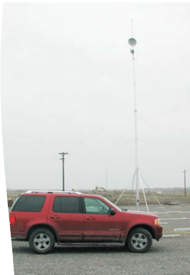
Wireless tower in place at the 100 N Area. The towers provide network services to remote sites.

With the help of Lockheed Martin Information Services, Washington Closure Hanford Information Technology and Facility Services teams have installed six wireless towers throughout the river corridor.