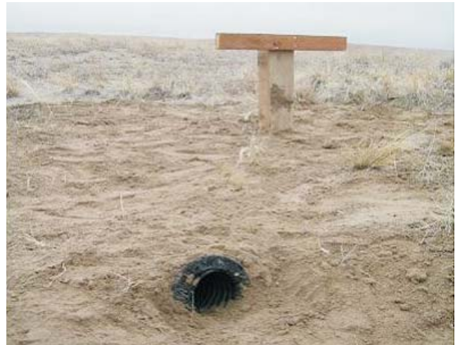
This is one of ten burrowing owl nest boxes recently installed near ERDF to support the local burrowing owl population. The nest is built from a buried tub and pipe tunnel to simulate a badger den, the chosen home of the burrowing owl.

The subcontractor planted sagebrush and installed the owl nests in an area equal in size to the piece of land impacted by ERDF overburden. April said they hope the nests will help sustain the vulnerable burrowing owl population,