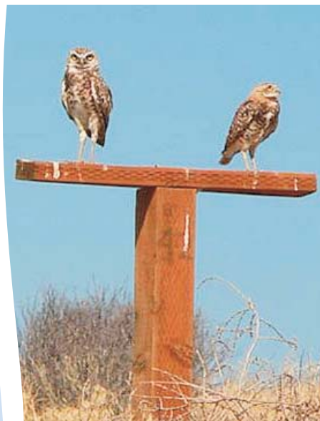
Owls perched at an existing site near Hammer .

which has been in statewide decline and listed as a species of concern by the Washington Department of Fish and Wildlife.