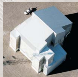
D Reactor Completed in 2004