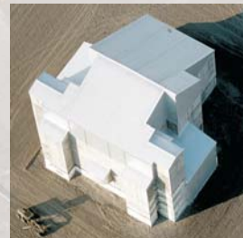
DR Reactor Completed in 2002