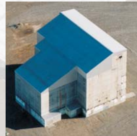
C Reactor Completed in 1998