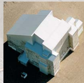
F Reactor Completed in 2003