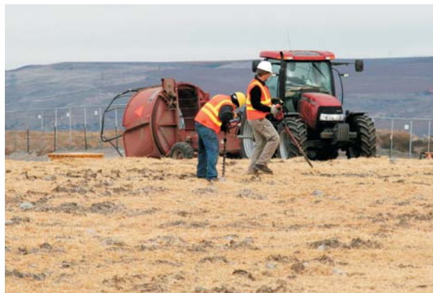
Workers plant native vegetation, completing the final step to meet a Tri-Party Agreement milestone at the complex, high-risk burial ground.