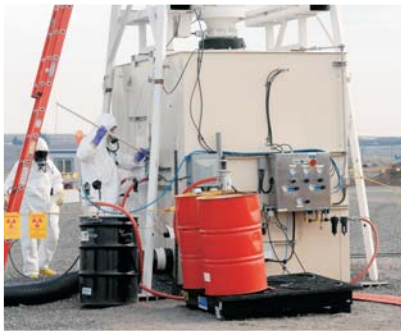
Sampling an excavated drum inside the drum penetrator

To support worker safety during retrieval of potentially contaminated and pyrophoric waste, the site and excavation equipment were equipped with temperature and air monitors to detect any changes in temperature, radiological or other hazardous conditions. To further ensure worker safety, the excavator cabs were fitted with blast shields. To limit worker exposure, potentially hazardous drums are weighted, sampled, sorted and opened remotely in an enclosed drum penetrator facility.