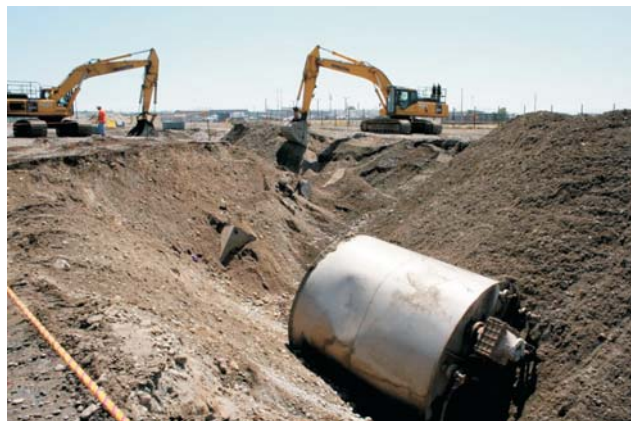
Stainless steel canisters were not expected in the Thoria trench.

In August, a small flash of fire occurred in the middle of three trenches at 618-7. Such an event was anticipated and safety procedures were executed as planned with no injuries or spread of contamination.