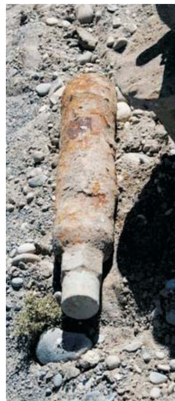
This cylinder was suspected to contain the highly toxic poisonous gas, phosgene. Significant safety procedures are required to sample and neutralized the contents.

One of the gas cylinders was suspected of containing phosgene, the other hydrogen chloride.