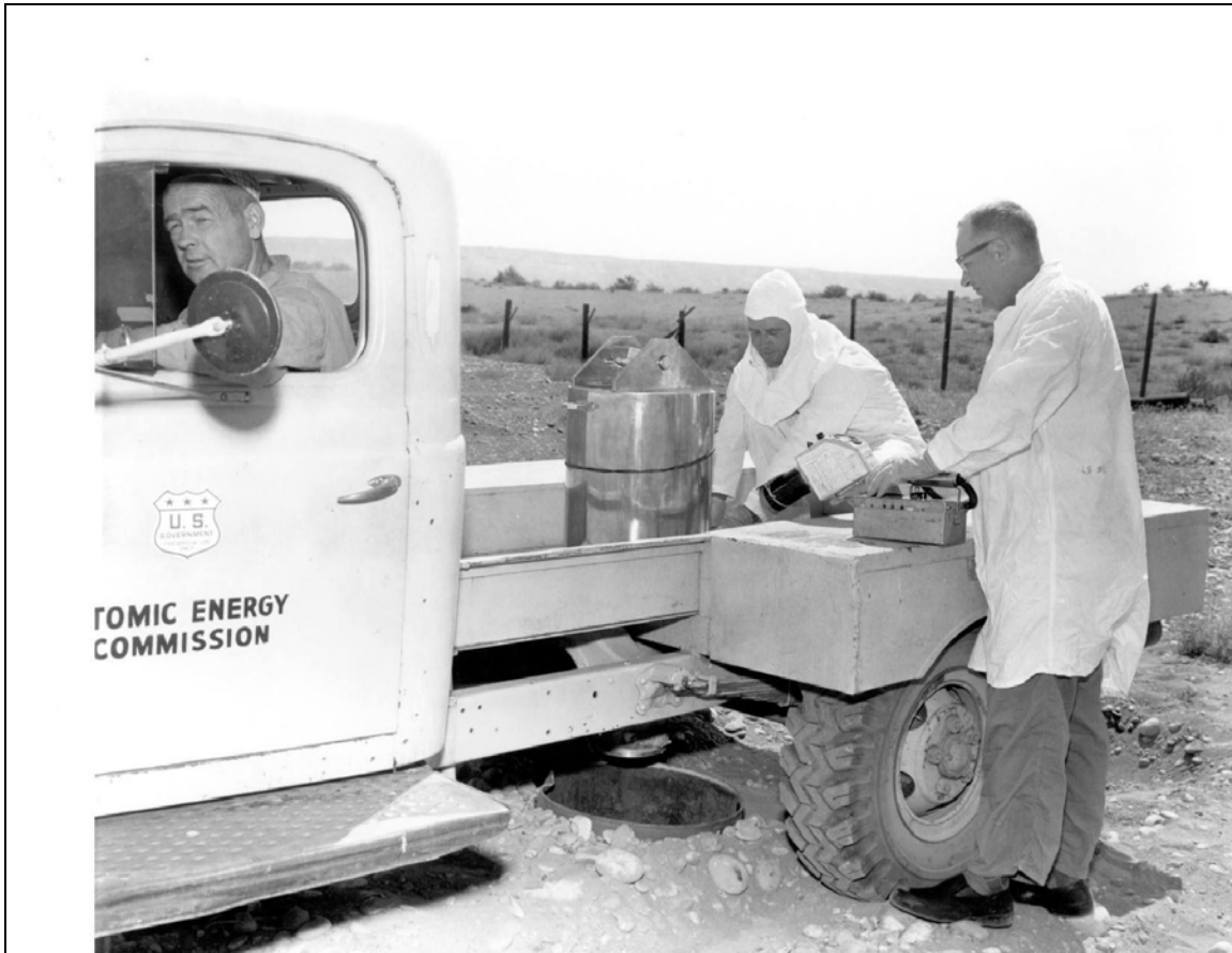
This photograph from 1961 shows a cask being unloaded into a vertical pipe unit at the 618-10 Burial Ground.

To date, 182 cone penetrometers have been installed to target depth of about 22 feet. Installation of the cone penetrometers in the VPU area is about 48 percent complete.