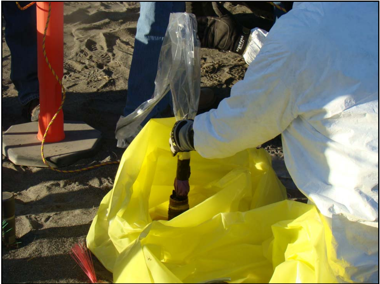
A borescope was used to inspect the affected cone penetrometer at the 618-10 Burial Ground.

A radiological survey near the perimeter of the cone penetrometers surrounding VPU No. 58 was completed. No contamination was found.