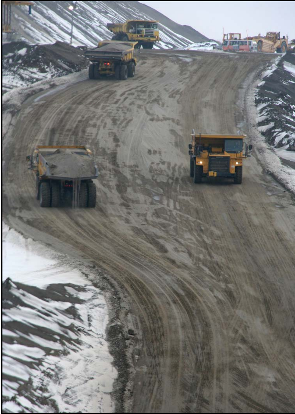
Delhur Industries personnel are excavating 1.6 million cubic yards of dirt from super cell 9 at the Environmental Restoration Disposal Facility.

DOE-RL continues to review the award package for the excavation of super cell 10 and the construction of super cells 9 and 10.