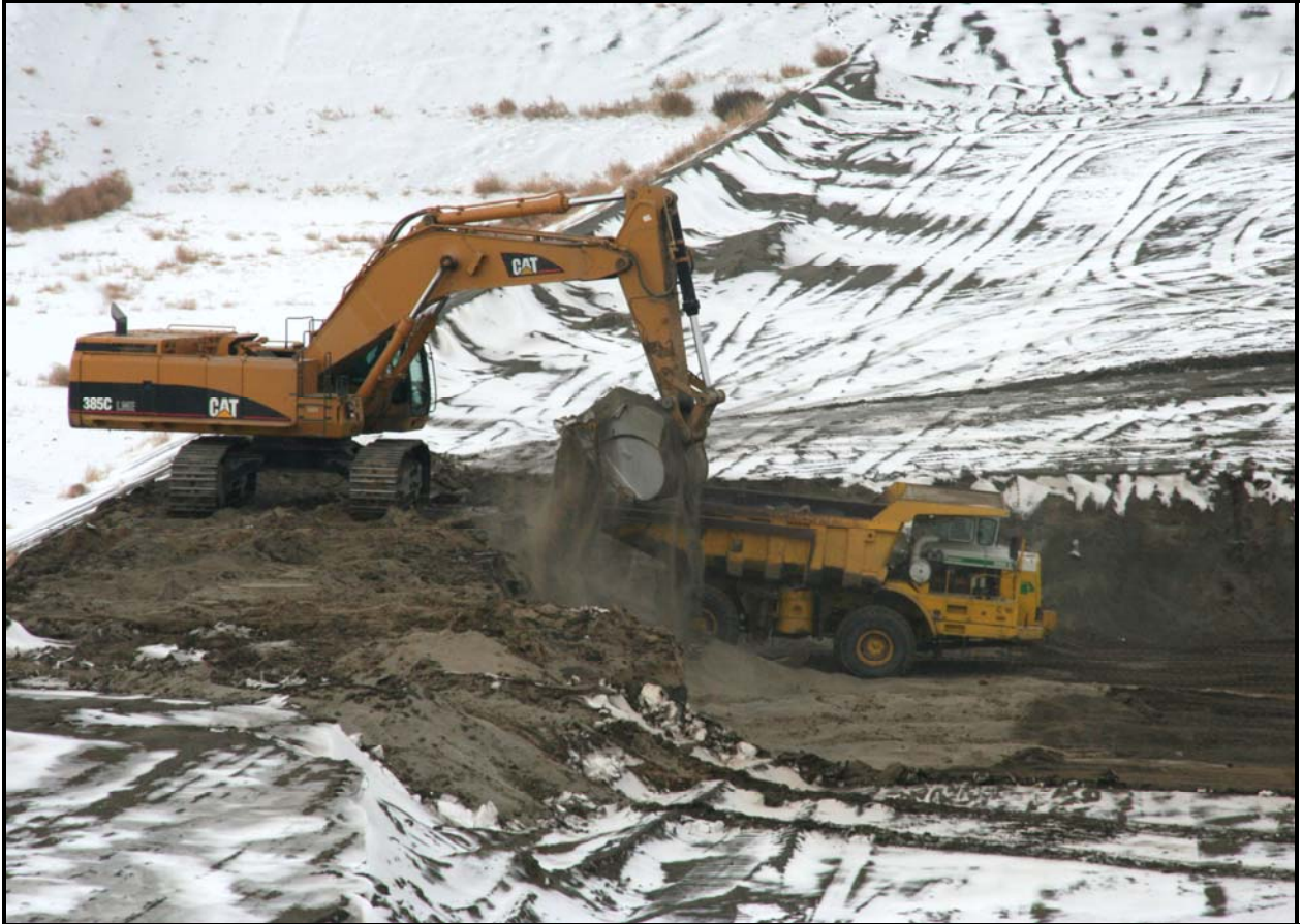
Delhur Industries personnel work through adverse weather conditions as they excavate super cell 9 at the Environmental Restoration Disposal Facility.

Under subcontract to WCH, DelHur Industries has excavated 1,555,917 cubic yards of material for super cell 9 (including 263,913 cubic yards of stockpile removal).