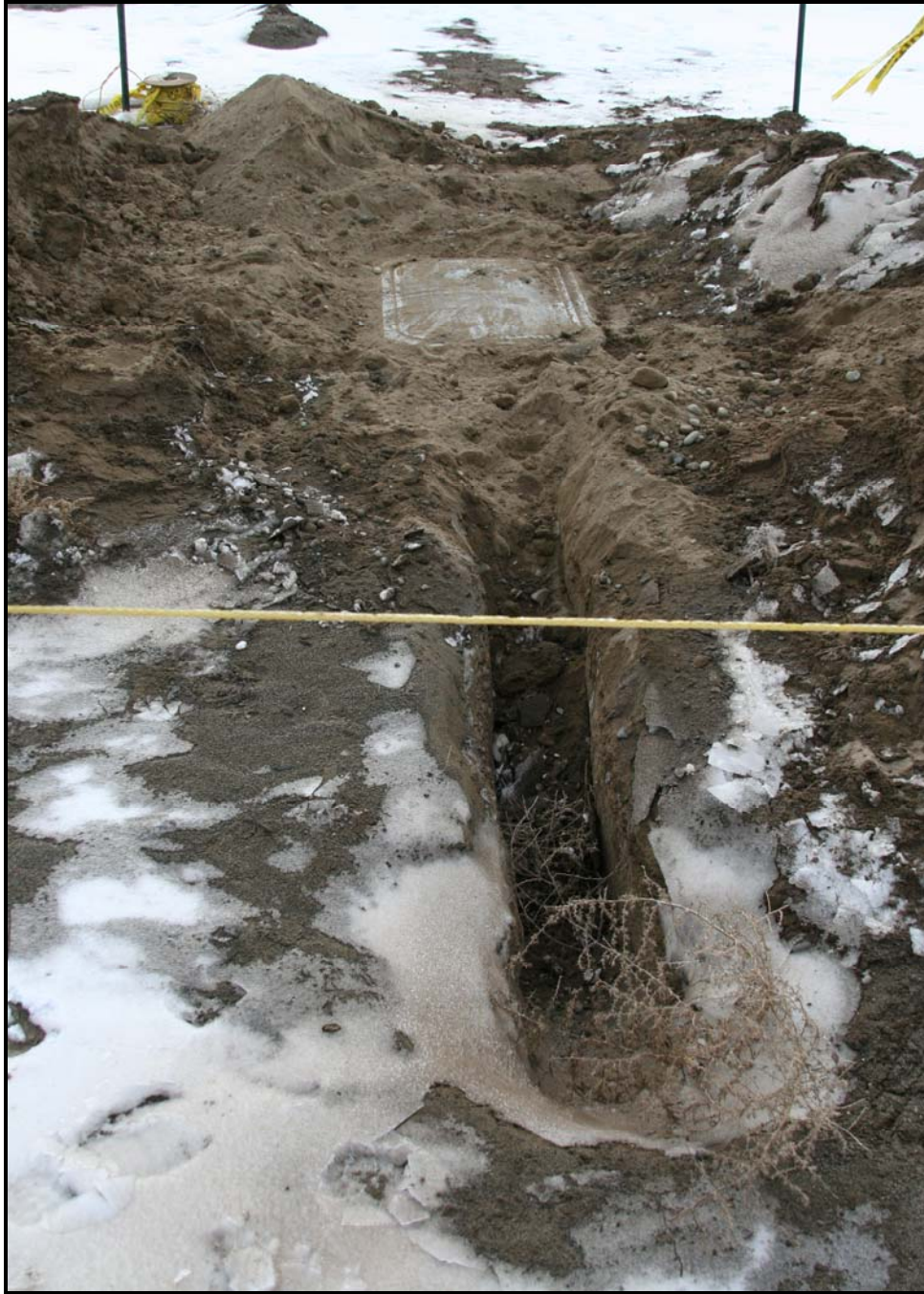
Three pull boxes, like the one shown above, were installed to run fiber optic cable from a control center to the new scale at the Environmental Restoration Disposal Facility.

Companies interested in expanding the truck maintenance facility, and constructing the new equipment and container maintenance facilities are being sought. Companies must be pre-