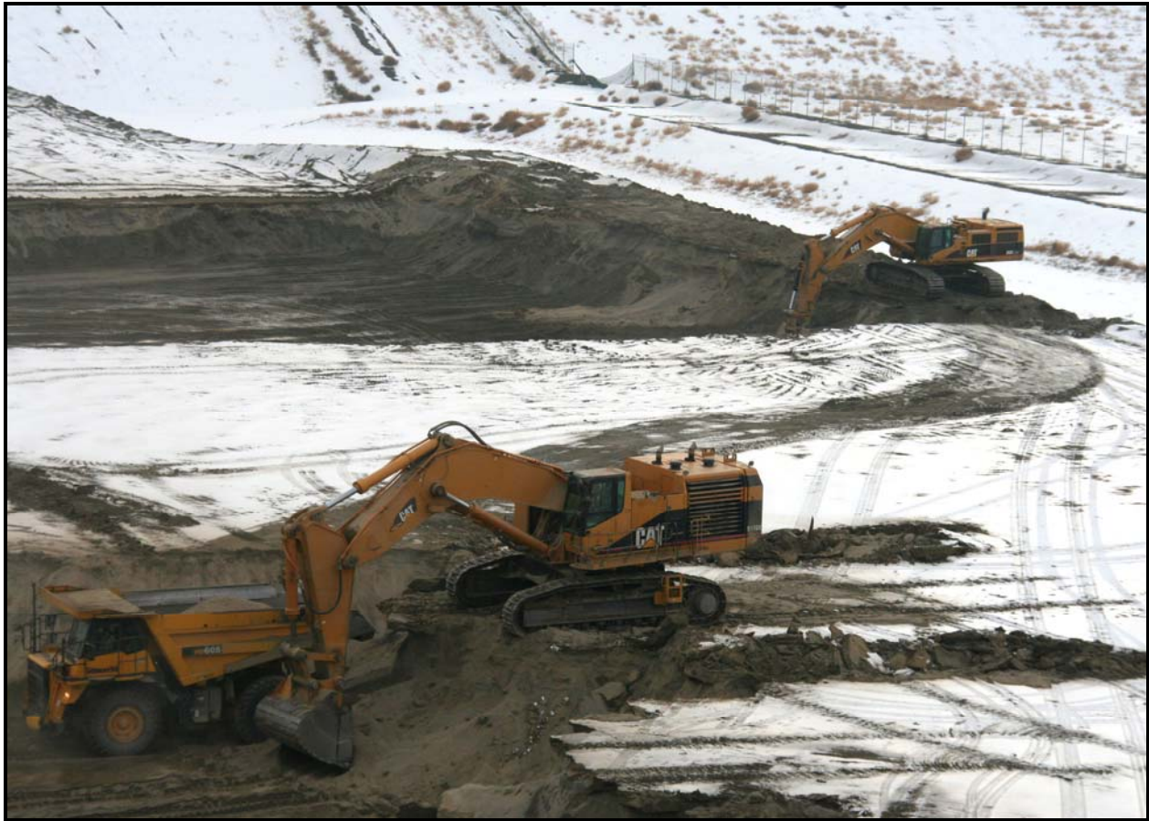
More than 80 percent of the dirt has been removed from super cell 9 at the Environmental Restoration Disposal Facility.