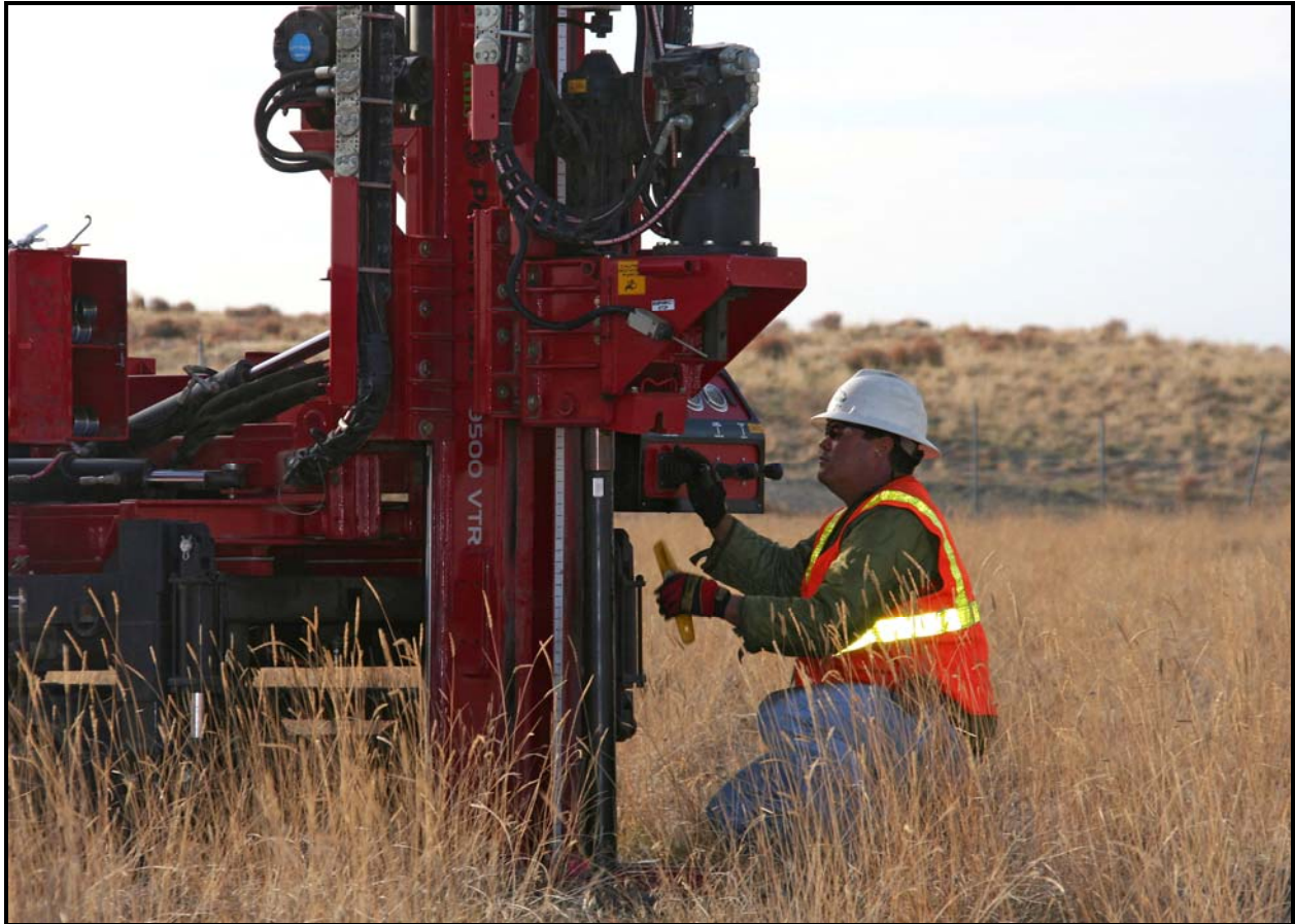
A North Wind Inc. employee works to install cone penetrometers at the 618-10 Burial Ground.

North Wind Inc. began installing cone penetrometers into the waste trenches. At least 10 cone penetrometers targeted to a depth of 30 feet are required to be installed per day, but work is ahead of schedule. So far, 76 cone penetrometers have been installed.