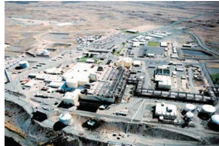
N Reactor is shut down 1987