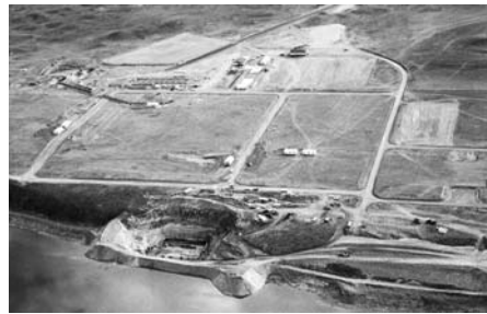
Construction begins on only dual-purpose reactor in the U.S. 1959