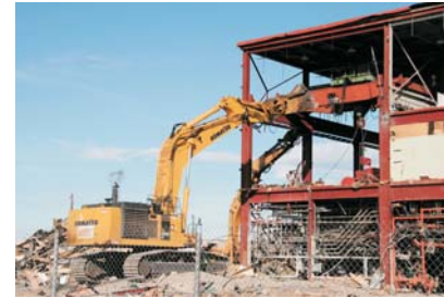
Reactor powerhouse demolition June 2008