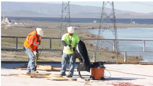
Workers prepare the steel support structure for the new roof above N Reactor.

Cocooning of N Reactor will include isolating the reactor building as well as the heat exchange facility (109-N building), which contains the steam generators.