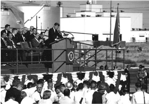
President John F. Kennedy spoke at the ground-breaking ceremony for the steam plant at N Reactor in 1963.

The last operating reactor at Hanford has completed a major step in the cocooning phase – the final stage of stabilizing and enclosing the highly radioactive reactor core for potentially 75 years. Located along the bank of the Columbia River, N Reactor was the only reactor in the country connected to a heat exchange facility for producing steam-generated electricity.