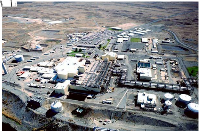
To protect the Columbia River and restore the one-square-mile N Reactor site, 109 buildings will be demolished and approximately 150,000 tons of debris moved away from the river.

Construction of the reactor began in 1959 and was completed in 1963. The reactor building alone is 85,450 square feet and includes three below-grade floor areas (47 feet deep), and four floors above grade level – the highest point is 80 feet tall. The reactor and heat exchanger building share a common four-foot-thick wall. The heat