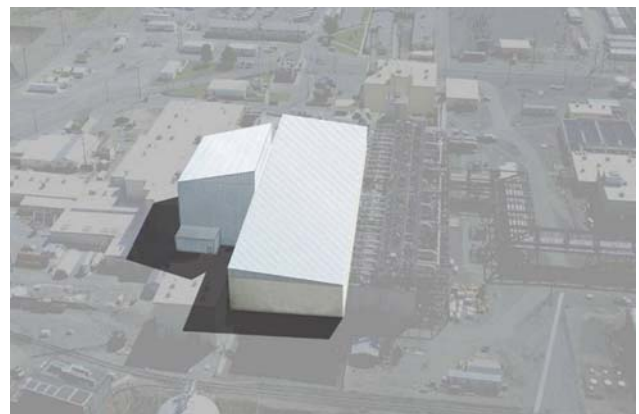
Conceptual drawing of cocooned N Reactor – complete by September, 2012.

Hanford's cocooned reactors are scheduled to remain in interim safe storage for up to 75 years to allow the U.S. Department of Energy, regulators and other stakeholders to determine the final disposal method and to allow the structures' high radiation levels to decay to safer levels.