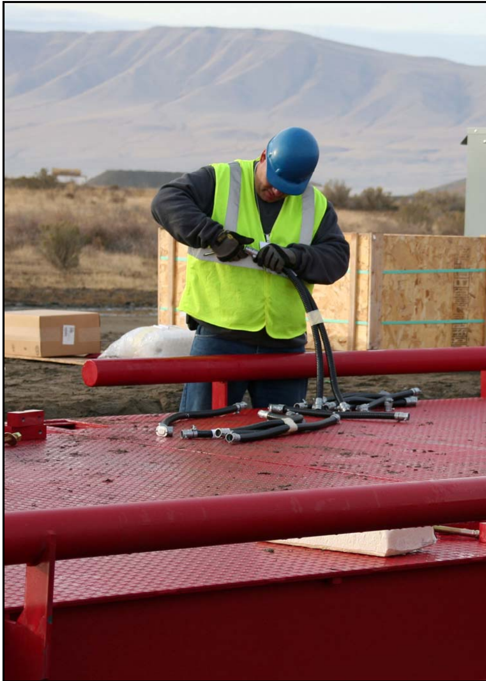
Installation of the new scale at ERDF nears completion.

This week WCH awarded a subcontract to local Richland firm George A. Grant Inc. to pave the back road into ERDF. The work will be completed by mid-November and will significantly improve traffic flow and safety on the road, which has come under much higher use with truck & pups, super dumps, construction traffic, and disposal of other Hanford contractor waste material.