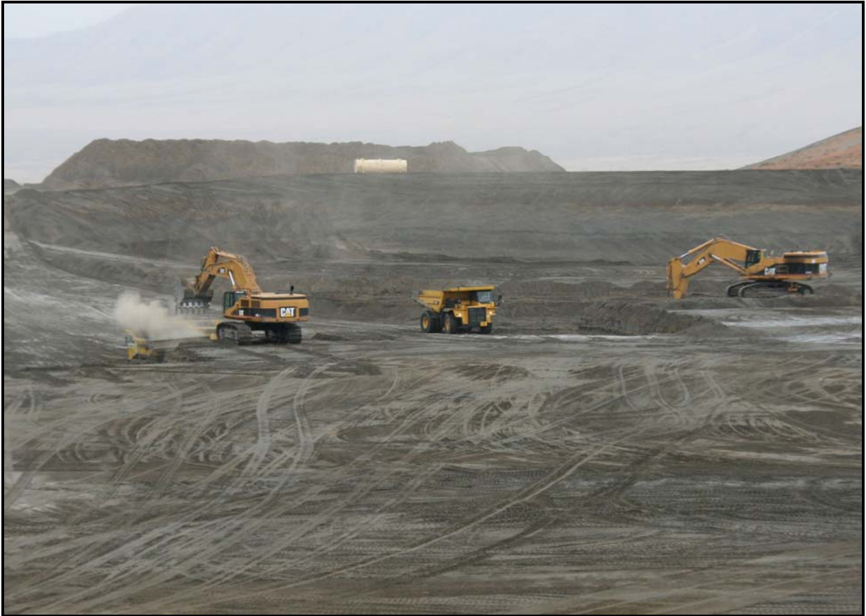
Excavation workers continue to make excellent progress on super cell 9 at the Environmental Restoration Disposal Facility.