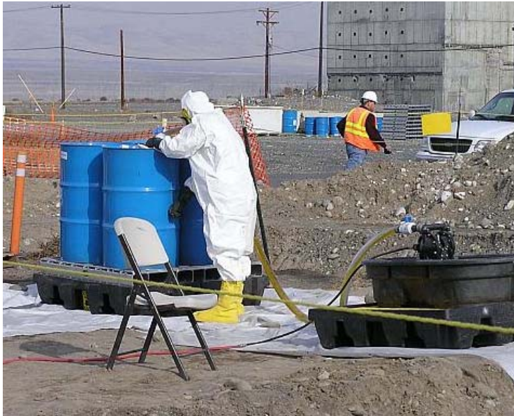
Chromium retrieval at 100-D by Field Remediation personnel.