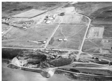
Construction begins on only dual-purpose reactor in the U.S. 1959