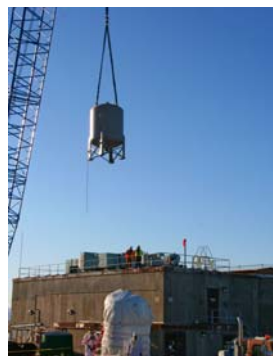
Recirculation building demolition December 2008