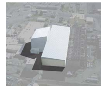
N Reactor cocooned September 2012