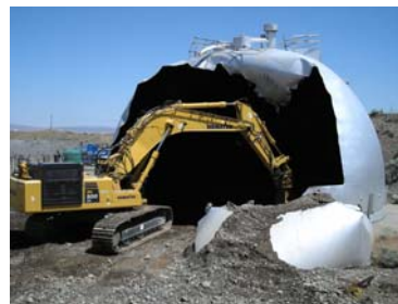
"Golf ball" waste facility demolition June 2009