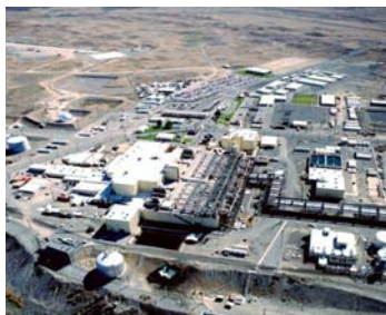
N Reactor is shut down 1987